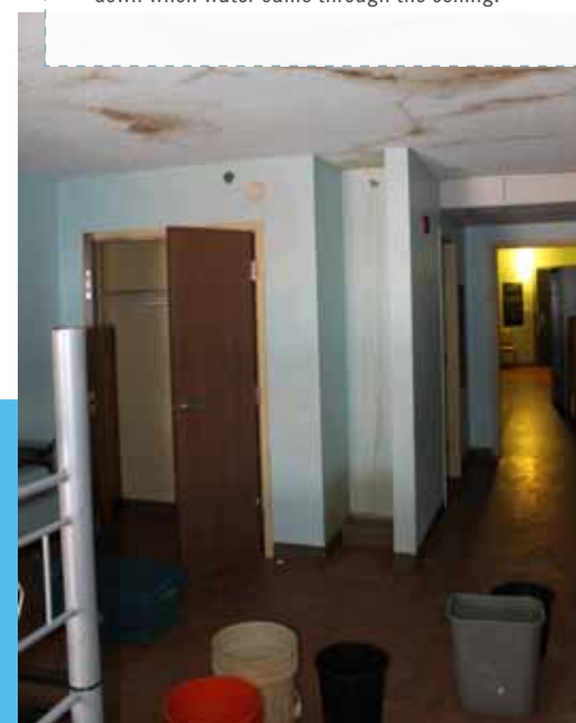
BELOW: Shelter Rooms like this one were shut down when water came through the ceiling.