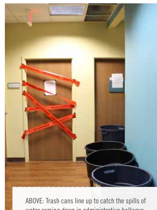
ABOVE: Trash cans line up to catch the spills of water coming down in administrative hallways.

ON THE COVER: Our Southern Indiana Campus gets a much needed update thanks to a grant received from the Horseshoe Foundation. The job couldn't have been done without help from our new partners at McRae Enterprises. McRae helped reduce the cost of shipping and donated their services to assemble the equipment. In addition, they volunteered to complete regular maintenance checks to keep the kids staying at the shelter on safe and sound equipment.