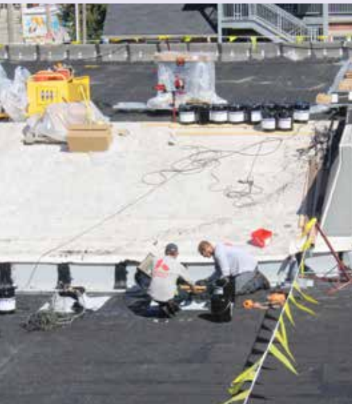
Crews working on the roof of the Second Street Campus over the summer.

To see the work in progress check out our slideshow available on YouTube at www.youtube/user/thecenteronline