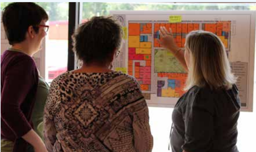
CWF staffers get the first peak at interior plans for the main campus.

Interior demolition is expected to begin in late November. The renovations will take several months; we anticipate that the building will re-open in summer of 2015.