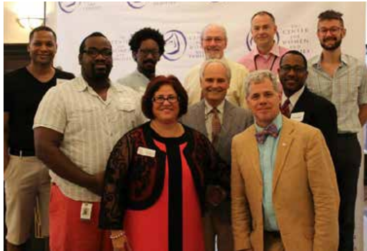
ABOVE: Friends and staff gather to celebrate MensWork joining The Center at the press conference held in September.

We are excited to announce that our long time partner, MensWork has officially joined The Center for Women and Families as another prevention project. With the shared vision of eliminating intimate partner and sexual violence, MensWork joining The Center is a smart strategic move toward our vision of creating violence-free lives, families and communities. This step allows us to combine talent and resources that will help expand our reach in the community and continue the work to engage, empower and organize men to join alongside women in preventing intimate partner and sexual violence in our communities.