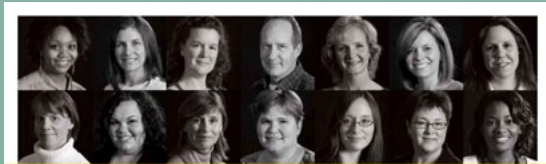
We are The Center. The Center for Women and Families 2009 Report to the Community